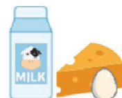
Milk & Cheeses Eggs